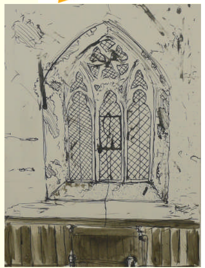
Above - The Eastern facing clear glass window. Pen & Blister Ink on Paper. 25th March 2011.